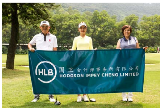
• Pictured at the golf club